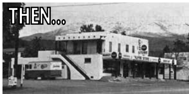
Alpine Blvd. & Victoria Dr.

How has life in Alpine changed? You be the judge—visit the exhibit to experience over 100 years of history documented in photos and objects at the Alpine Historical Society's John DeWitt Museum, 2116 Tavern Road, Alpine.