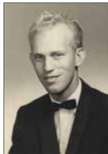
High School Graduation~1962