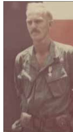
Silver Star Recipient, Vietnam~1968