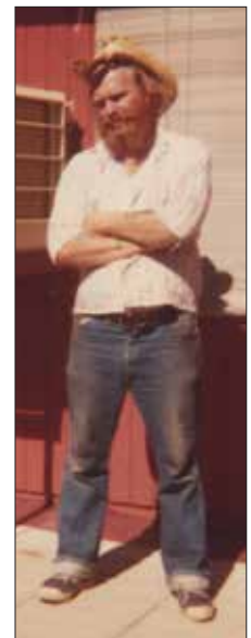
At home~ 1981