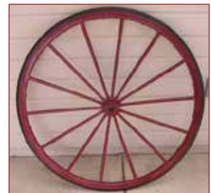
One of the restored, painted wheel. Isn't she lovely!

All things considered, we have made excellent progress on this restoration project and have enjoyed it immensely. Our work crew meets regularly on Wednesday mornings, from 9:00 a.m. to noon, and volunteers are always welcome!