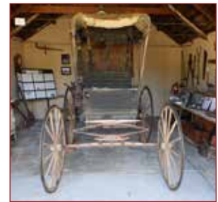
The original buggy

However, some things we could not do, so the sanded and painted seat is now in the hands of an upholstery expert for restoration, and we will soon be working with a pinstriping craftsman to restore the vintage paint details.