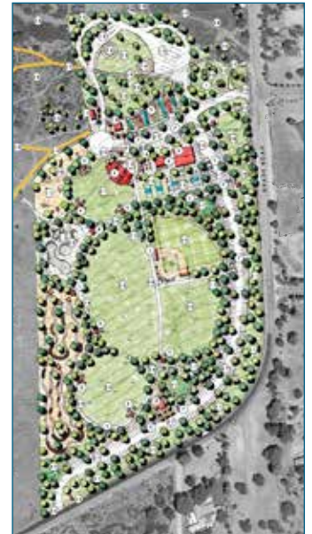
Alpine County Park, full map at sdparks.org/publicmeetings

The use of potable water for irrigation is highly questionable in San Diego County where such water is precious. If possible, the County should use reclaimed water for irrigation needs and/