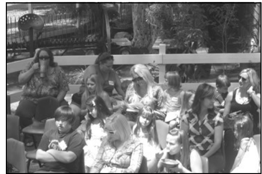
The crowd gathers for the award ceremony.