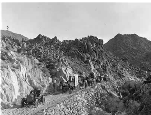
An old road in San Diego County.

With the establishment of the post office, this place, known in mission and rancho days as Mesa del Arroz and Valle de las Viejas, became officially "Alpine." the airy new name, coinciding with a tuberculosis epidemic, drew patients from near and far. "Best Climate in the U.S.A. by Government Report." Picking a marketable name like "Alpine" was a great idea! ■